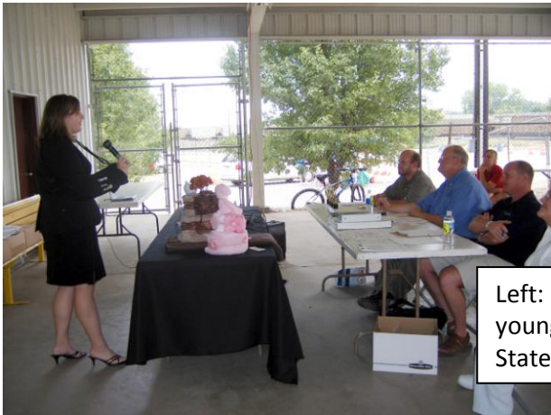
Left: Members of NET-Force help judge young entrepreneurs during a Nebraska State Fair 4-H Entrepreneurship Event.