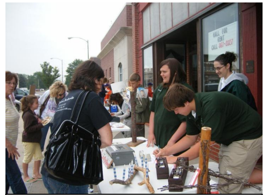
Butler County 4-H hosted its second successful ESI Discovery Zone Camp this summer.

Take note! These young people are the future of our local communities and the state as a whole. Nurturing the entrepreneurial spirit in our young people is alive and well through the growing number of ESI camps, classes, and after-school programs.