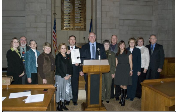
Members of NET-Force are recognized during the Governor's Proclamation of National Entrepreneurship Week in 2009

In July of this year (2000) members convened at the Southeast Community College Entrepreneurship Center for a day-long strategic planning session. From this meeting, a new strategic vision and action plan are evolving. So, if you wish, here is a short list in no particular priority order, of what NET-Force hopes to accomplish in the months and years ahead.