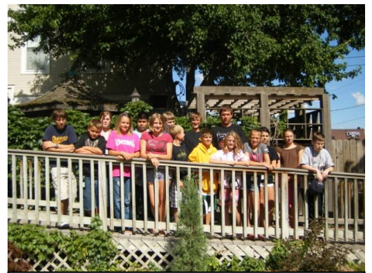
Central Community College-Columbus hosted a 4-H ESI Discovery Zone Entrepreneurship Camp from July 20-22.